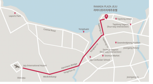
Ramada Plaza Jeju Hotel, Jeju island